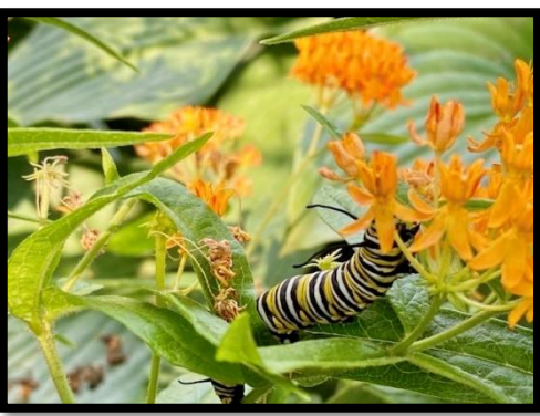
Asclepius tuberosa In Wendy Weber's garden!